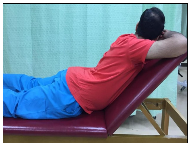
Figure 4: Sustained extension