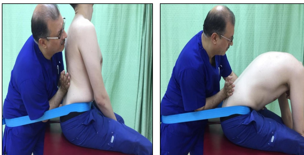
Figure 1: Start and end positions for lumbar sustained natural apophyseal glide (SNAG)

SNAG technique was applied from a sitting position on the edge of the table while both feet were on a foot rest. A specialized Mulligan belt was used around the patient's waist and therapist's hips. The mobilizing force was applied parallel to the facet joint plane (cephalic direction) and over the spinous processes of the respective symptomatic spinal levels (Fig.1). The patients were asked to lean forward as much as possible during application of the mobilizing force and then return to the starting position while the therapist maintained his mobilizing force until the end. The symptomatic level was determined clinically by using the standardized objective examination combining active trunk movements and posteroanterior mobilization of the lumbar vertebrae. The SNAG dose for each level was SNAGS were applied in flexion, extension and rotation. SNAGS were applied for few seconds with 3 repetitions on first day and 10 repetitions from next visit 3 times per week for 4 weeks. Study also included active as well as therapist facilitated stretches. Stretches were maintained for 15 -20 seconds with 10 repetitions of each stretch per session. It was performed before the conventional program 12,18 .