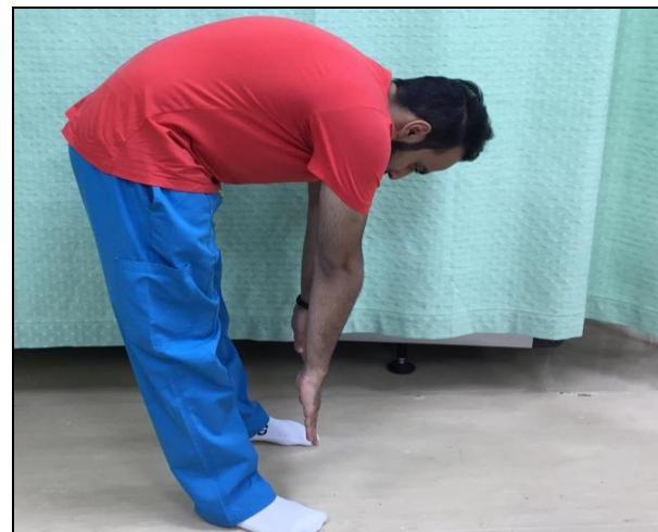
Figure 6: Flexion in standing

Follow-up: The treatment was given over a period of 4 weeks 3 visits per week once a day.