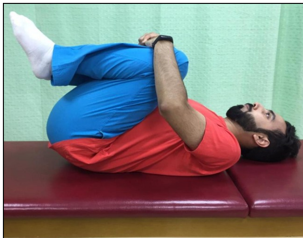
Figure 5: Flexion in lying